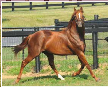
Limehouse - La Iluminada, by Langfuhr 2007, ch, 16.2 hands, entered stud 2013