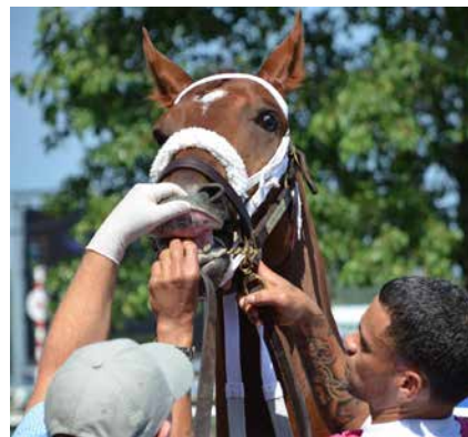
Horse identifier checking Pure Spring's tattoo prior to finishing third in the fourth race.