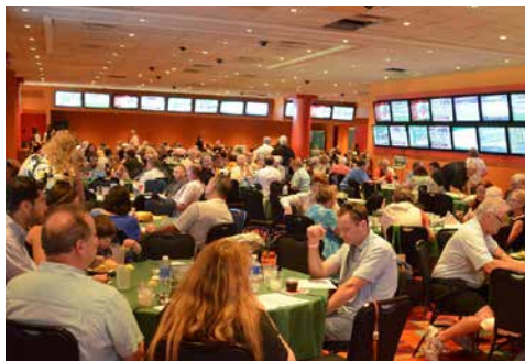
Crowd enjoying lunch and contemplating bets at PHBA's 15th Pennsylvania Day at the Races.