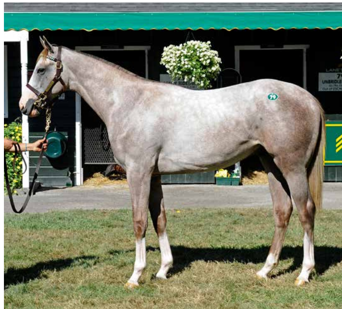
Lydia A. Williams

During the Fall Festival, PA-Bred restricted races are jumping to levels of $74,000 for A2X, $70,000 A1X, $60,000 MSW and $35,000 for Claiming 12.5 N2. Open races are worth as much as $120,000 (including the owner bonus).