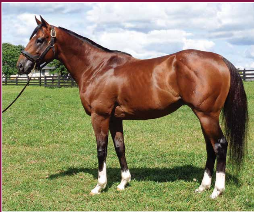
Maimonides—Littleprincessemma, by Yankee Gentleman

Son of Maimonides , Hopeful S-G1-placed, by champion VINDICATION , from a sire family: half-brother to leading sires ROMAN RULER and EL CORREDOR .