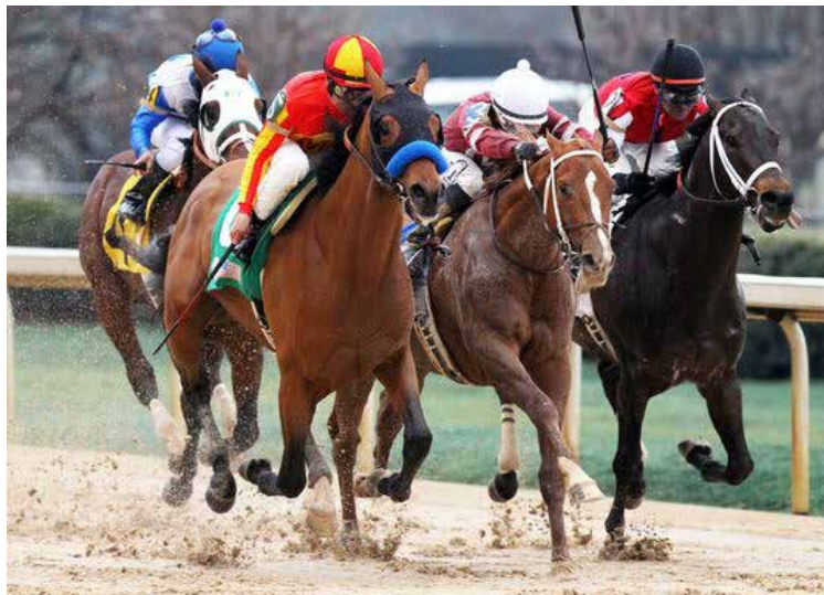
Hoppertunity (red and yellow silks) charged home for his first stakes win in Oaklawn Park's Grade 2 Rebel Stakes.

Bayern impressed with his 15-length allowance score at Santa Anita in February and remains on the Derby trail after posting a solid work on March 20.