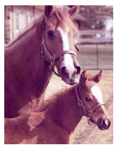
Brushwood Stable's Tarfaya with future stakes winner Storming Inti in 2011.

All 10 foals produced by Layounne were bred by Brushwood. Six of her eight starters are winners, including graded stakes-placed Dark Cheetah, Mogador and Shadow of Storm. Tarfaya never started, and overcame numerous obsta-